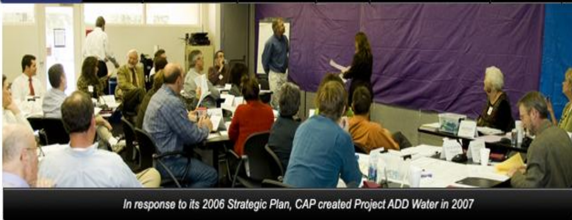
In response to its 2006 Strategic Plan, CAP created Project ADD Water in 2007

CAP MEETINGS WORK PRODUCTS BACKGROUND HISTORY PUBLIC PARTICIPATION CONTACT US