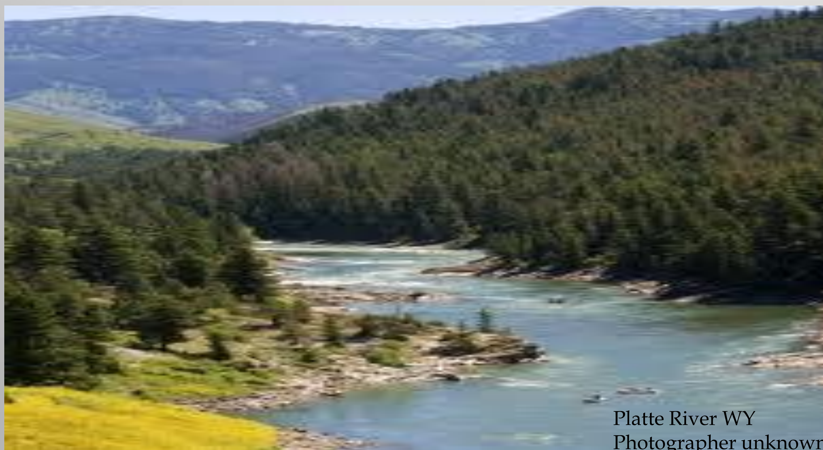
Platte River WY